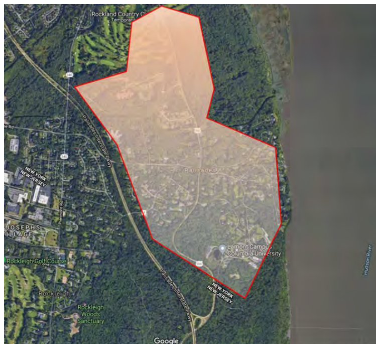
Figure 3: Preferred Geographical Location of non-wires alternatives Solution:

The non-wires alternatives solution will need to be sited along Route 9W and adjacent property between Rockland Road and NY-NJ boarder line and Oaktree Road between NY state- Route 9W and Palisade Interstate Parkway. One 2MW/11MWhr DER will be connected to circuit 50-3-13. The vendor is responsible to size the batteries correctly to support the peak demand requirement and durations for the circuit contingency. The DER output needs to match the kW/hour as per the load curve referenced in Exhibit-1. The DER (i.e. battery storage) shall be charged during off peak hours. The potential Distributed Generation site would require the vendor to explore and review associated local permitting laws and regulations. The project may require underground distribution feeder and /or utility poles installations to connect to the DER site.