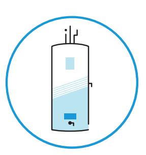
Hot Water System