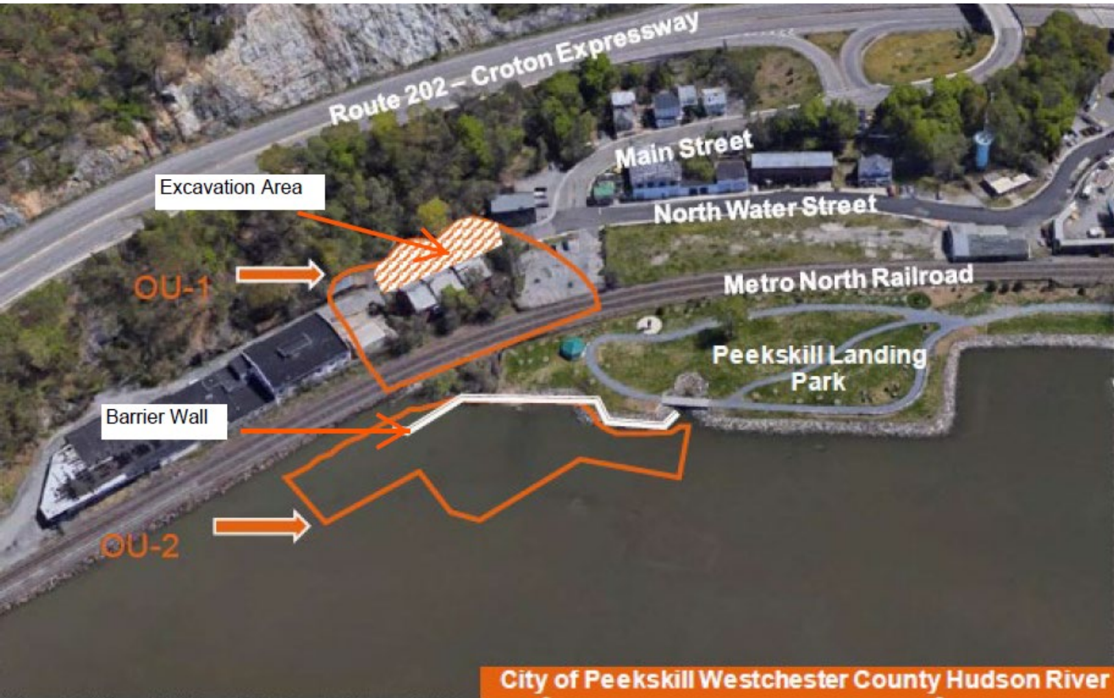
Site Location Map