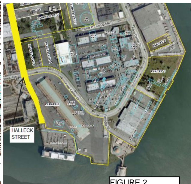
FIGURE 2 Current Site Layout