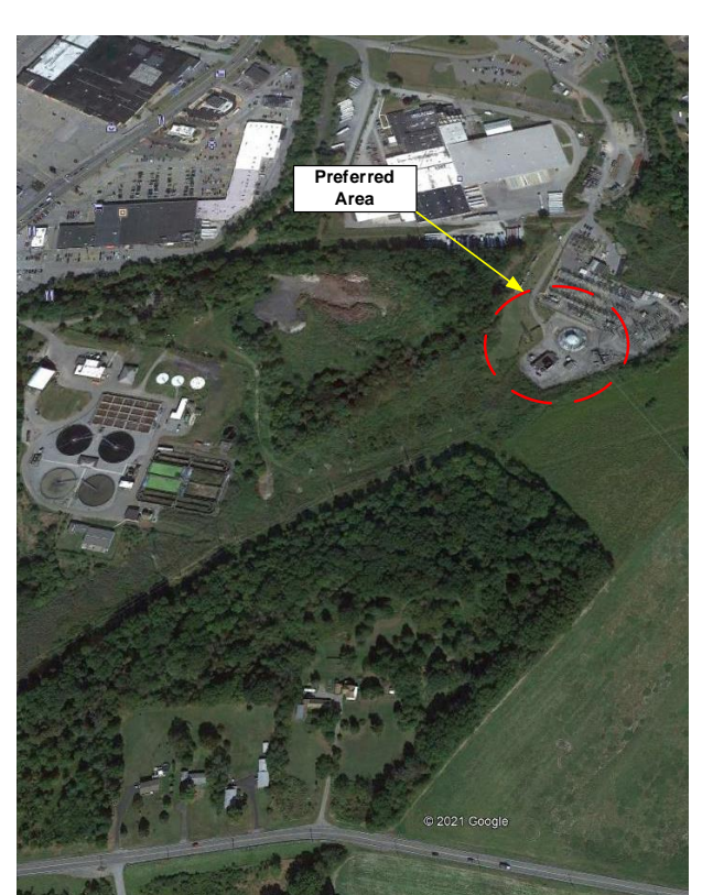
Map #4: Shoemaker & Hillburn Plants (areas within red-zone preferred).

Interconnection at either site would be at the power plants and must be coordinated through and with Alliance Energy (or current owners). No additional connections to the O&R system will be provided. The locations of the two sites are shown in Map #4 below.